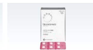
Transino (OTC Related Drugs)