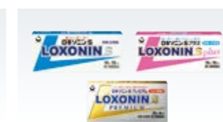
Loxonin S (OTC Related Drugs)