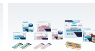
levofloxacin (Generic Drugs)