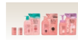
MINON series (OTC Related Drugs)