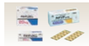
TENELIA, CANALIA (Japan)