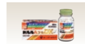
Lulu (OTC Related Drugs)