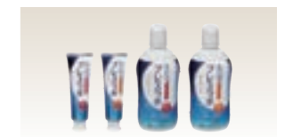
Breath Labo (OTC Related Drugs)