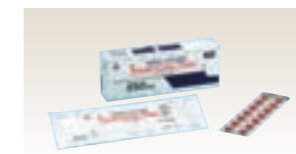
Gefitinib (Generic Drugs)