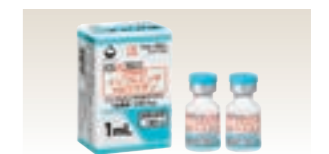
Influenza HA Vaccine (Vaccines)