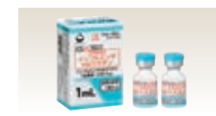
Influenza HA Vaccine (Vaccines)