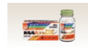
Lulu (OTC Related Drugs)