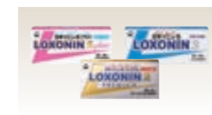
Loxonin S (OTC Related Drugs)