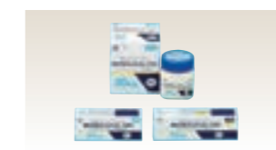
olmesartan (Generic Drugs)