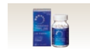
Transino (OTC Related Drugs)